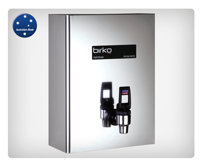
Instant Boiling water when you need it.