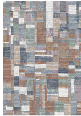
63244-2626 Pave Multi