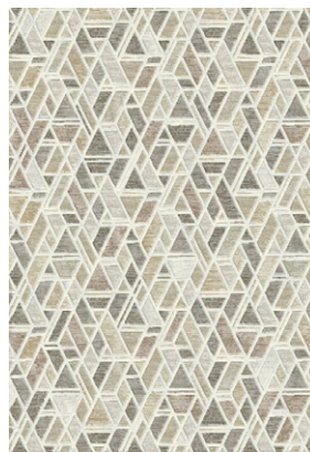
63398-6282 Prism Neutral