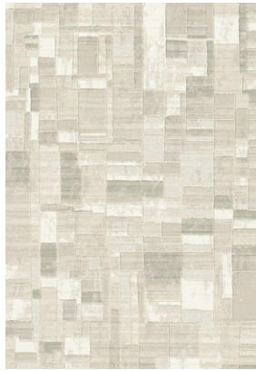
64244-6575 Pave Neutral