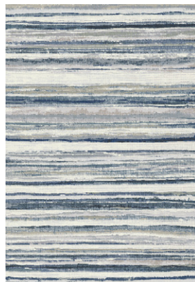
63164-6141 Channel Ocean