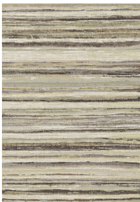
63164-8282 Channel Almond