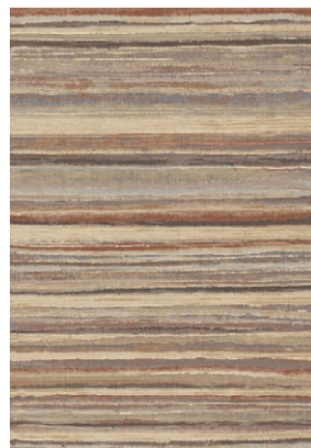
79164-4848 Channel Flame